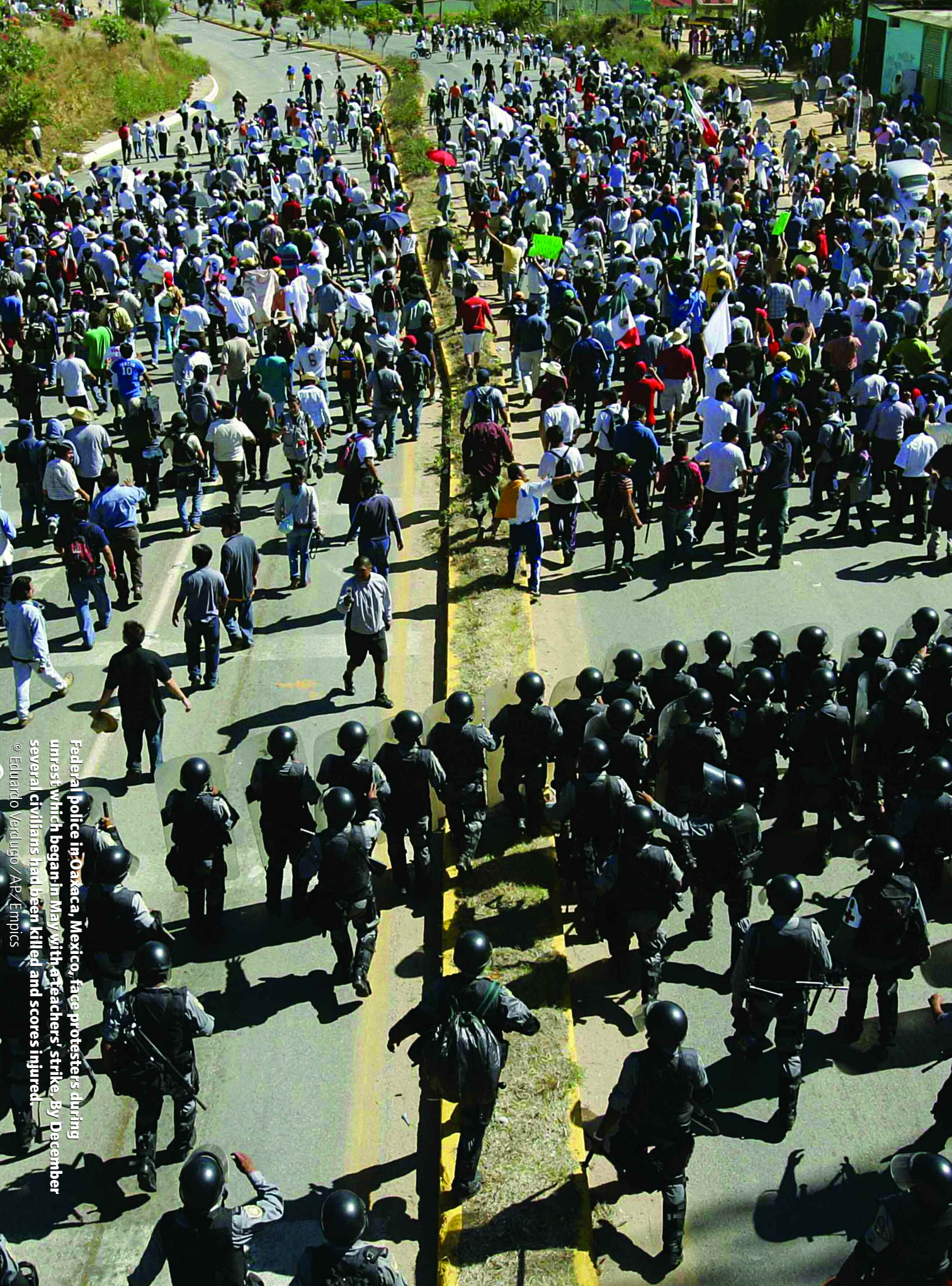
Federal police in Oaxaca, Mexico, face protesters during unrest which began in May with a teachers' strike. By December several civilians had been killed and scores injured.